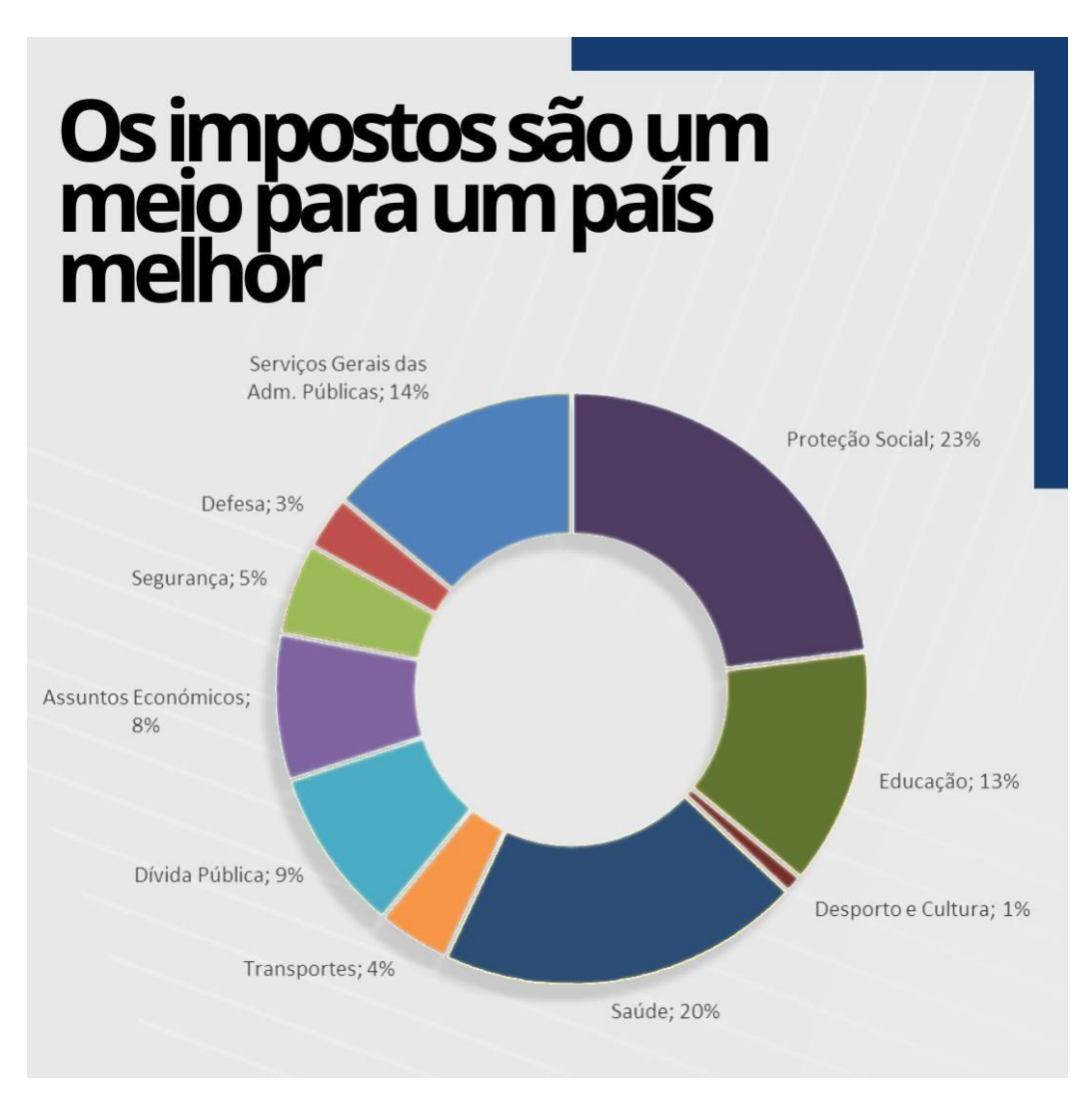
Graph 2: Distribution of taxes by sector

Source: Idealist, 7 July 2023<sup>71</sup>